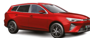
DYNAMIC RED TRI-COAT PAINT