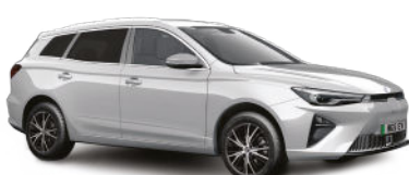
COSMIC SILVER METALLIC PAINT