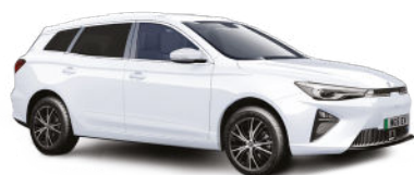
ARCTIC WHITE STANDARD PAINT