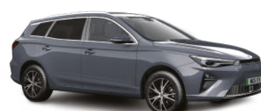
HAMPSTEAD GREY METALLIC PAINT