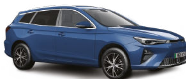
PICCADILLY BLUE METALLIC PAINT