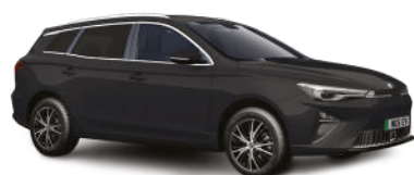
BLACK PEARL METALLIC PAINT